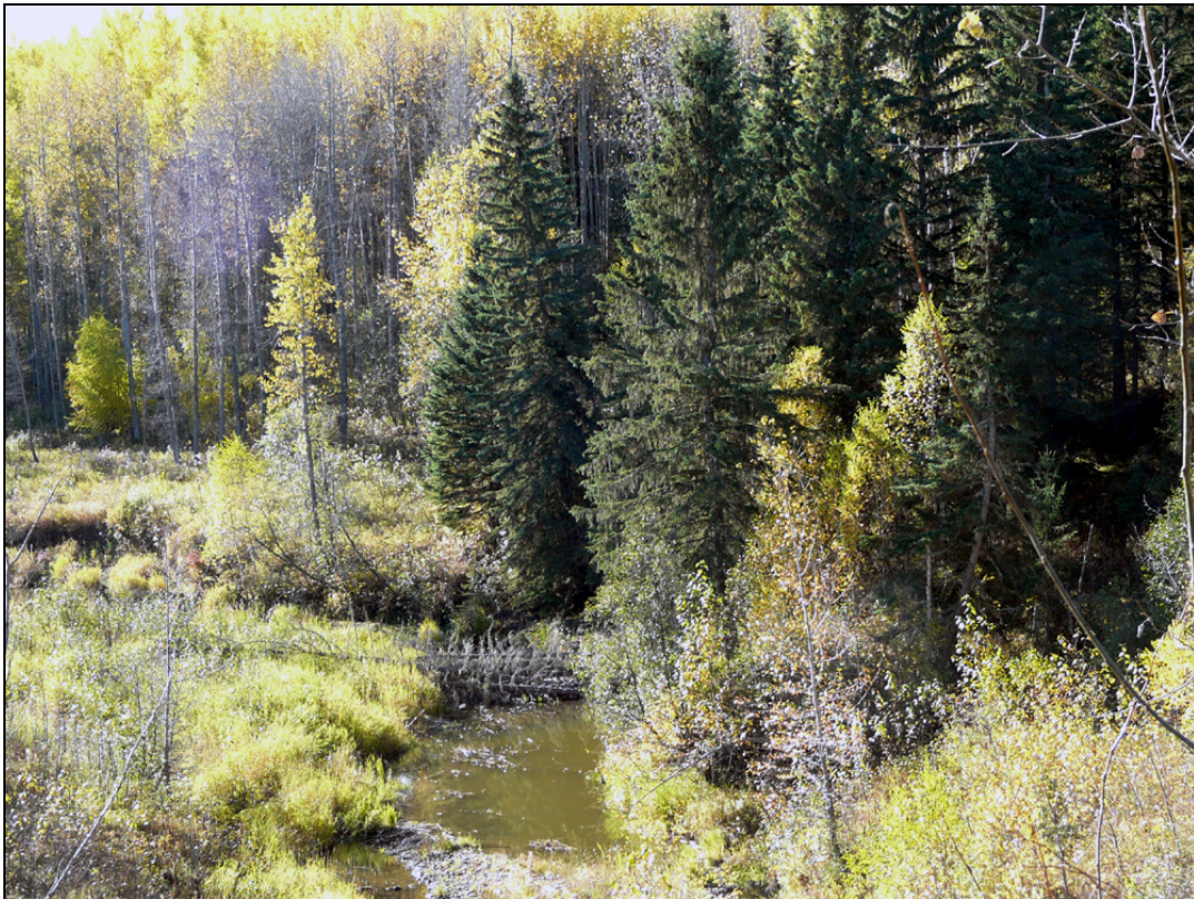
Mixed woods beside East Poplar Creek, 28 September 2008

Charles Durham Bird Box 22, Erskine, AB, T0C 1G0 8 March 2012