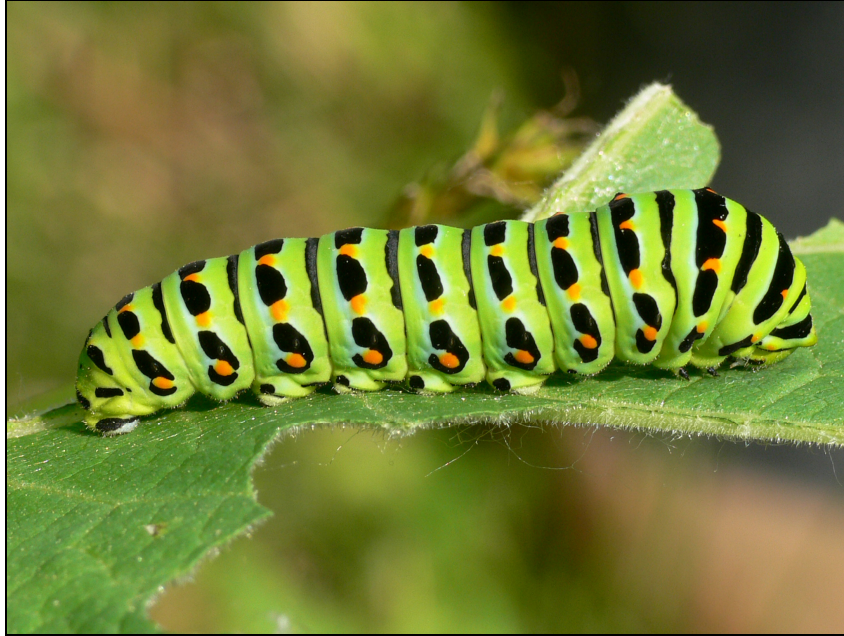
Papilio zelicaon caterpillar on Heracleum lanatum , 2 Jul 2006.

1090. Papilio zelicaon Lucas (4167. Papilio zelicaon Lucas) (Anise Swallowtail) – Though adults have not been collected, caterpillars have been found (see above) feeding on Cow Parsnip ( Heracleum lanatum ).