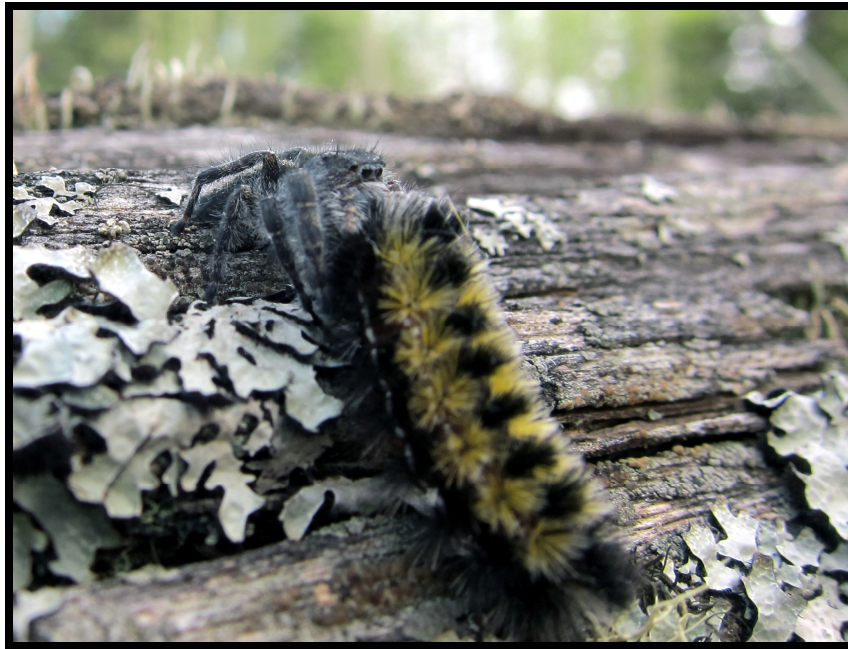
Phiddipus borealis spider and Ctenucha virginica caterpillar, 8 km NW of Winfield, 21 May 2011.